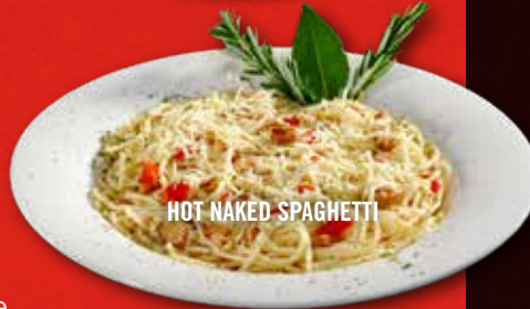
HOT NAKED SPAGHETTI

HOT NAKED SPAGHETTI Spicy garlic parmesan sauce with red bell pepper, sliced Italian sausage links & Romano over Spaghetti 17.80