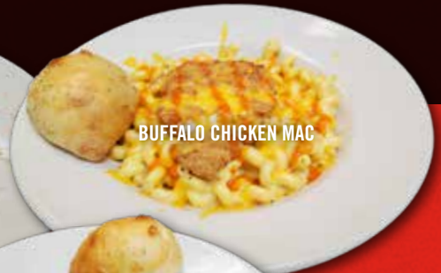
BUFFALO CHICKEN MAC