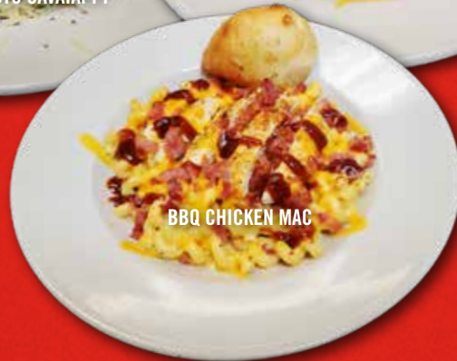
BBQ CHICKEN MAC