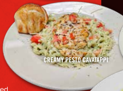
CREAMY PESTO CAVATAPPI

MUSHROOM & SPINACH MAC Spinach, mushrooms & feta cheese 18.65