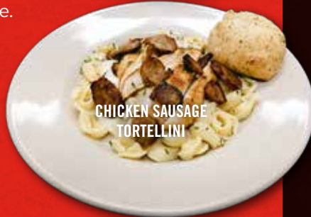
CHICKEN SAUSAGE TORTELLINI

CHICKEN & SAUSAGE TORTELLINI Cheese filled tortellini topped with chicken and sausage, served with a creamy alfredo sauce 20.30