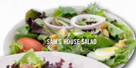
SAM'S HOUSE SALAD

GARLIC KNOTS Our homemade dough seasoned with garlic oil and italian seasoning. Served with a side of our Signature pizza sauce. 8.90