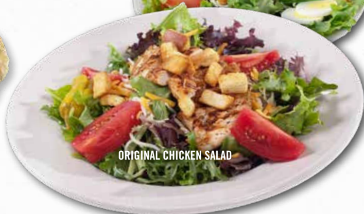
ORIGINAL CHICKEN SALAD